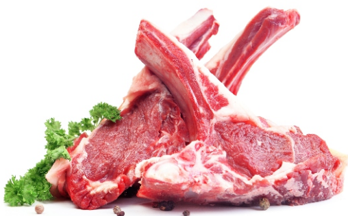
Goat & Sheep Mutton Chops