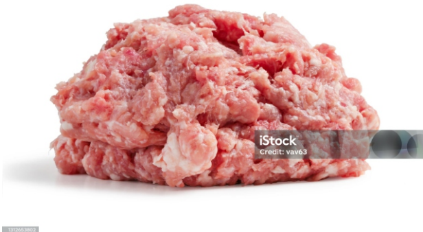
Goat & Sheep minced for Kebab