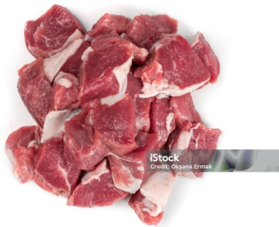
Goat & Sheep Mutton Boneless

products but upholding the highest standards of safety, sustainability, and ethical sourcing.