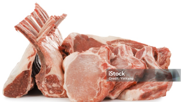
Goat & Sheep Mutton Assorted