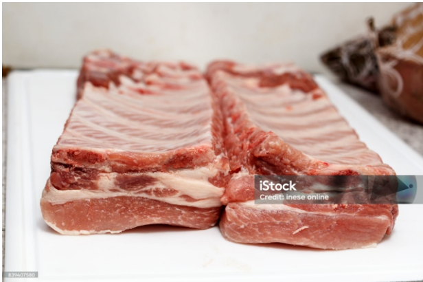
Goat & Sheep Mutton Ribs