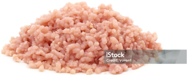
Goat & Sheep Mutton Kheema