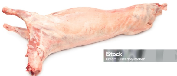
Goat & Sheep Mutton Custom Requirement