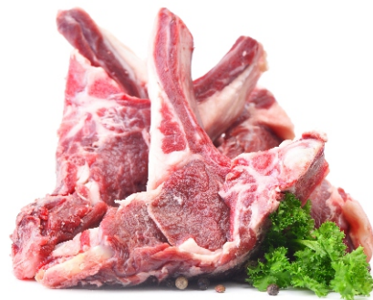
Goat & Sheep Mutton Biryani Cut