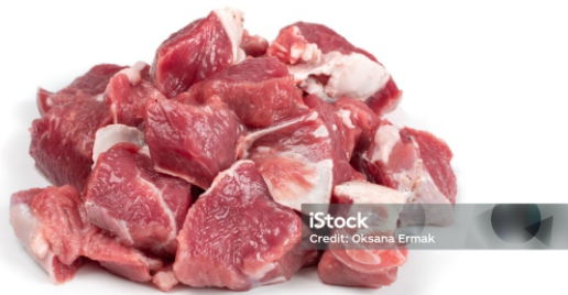
Goat & Sheep Mutton Curry Cut

redefine quality standards and customer satisfaction, we take immense pride in being a leading player in the export and