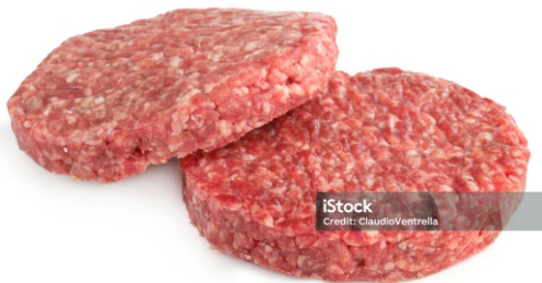
Goat & Sheep Mutton Burger Patty