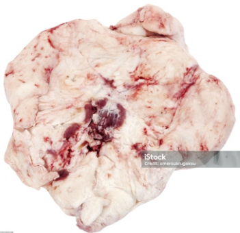
Goat & Sheep Mutton Fat