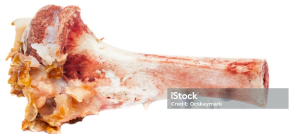
Goat & Sheep Mutton soup Bones